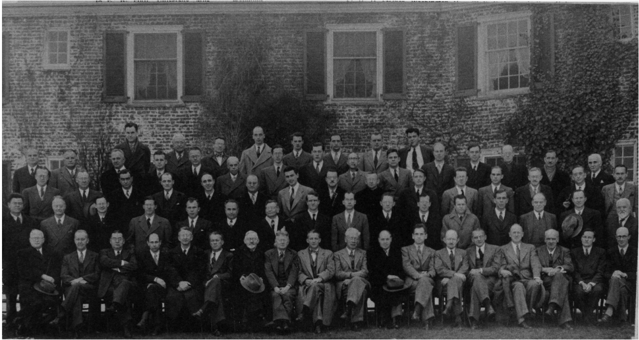
Figure 2. Photograph of participants at the 1947 Society for the Study of Evolution meetings in Princeton. Photograph reproduced from the edited publication of the proceedings (see Jepsen, Simpson, and Mayr 1949). Identification of the all-male participants included therein.